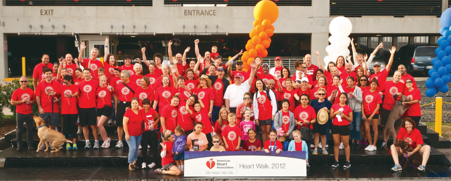
Methodist Health System employees raised more than $16,000 for the Dallas County American Heart Association Heart Walk.